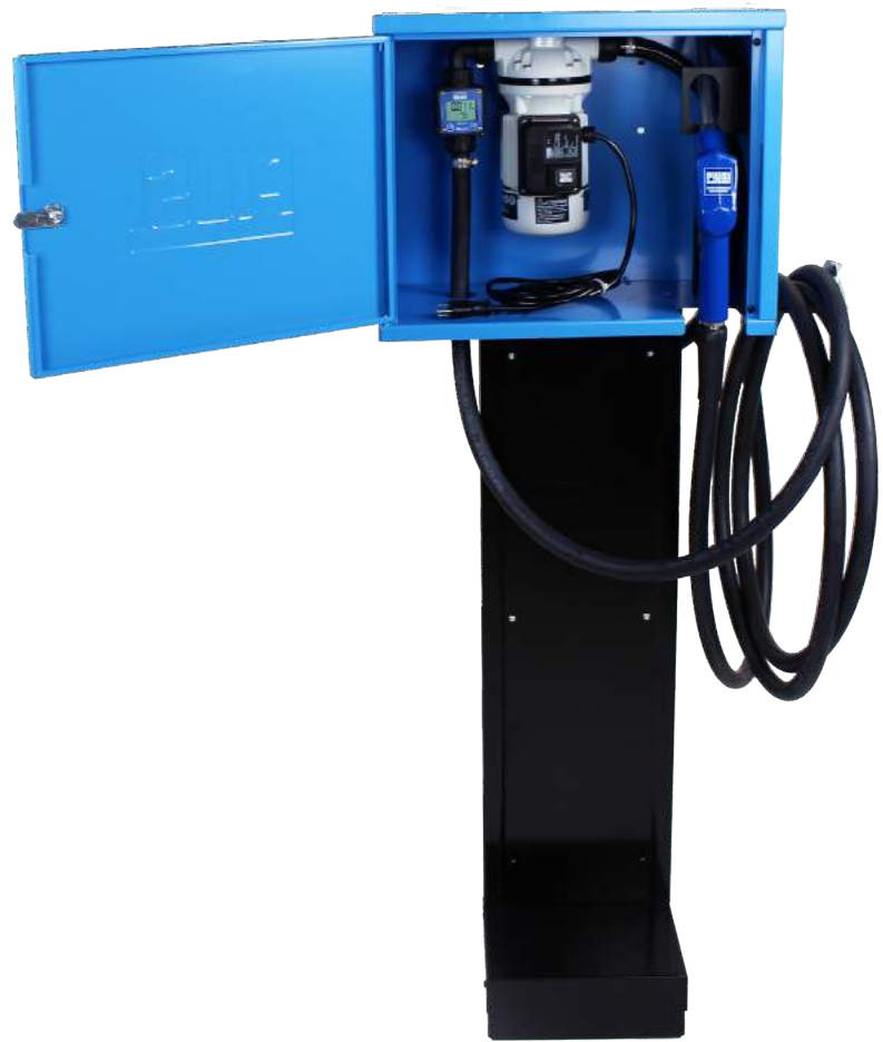
DEF BLUE BOX PEDESTAL (FULLY ASSEMBLED)